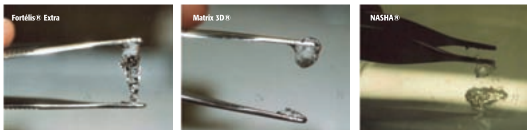
Figure 7: Comparative elasticity