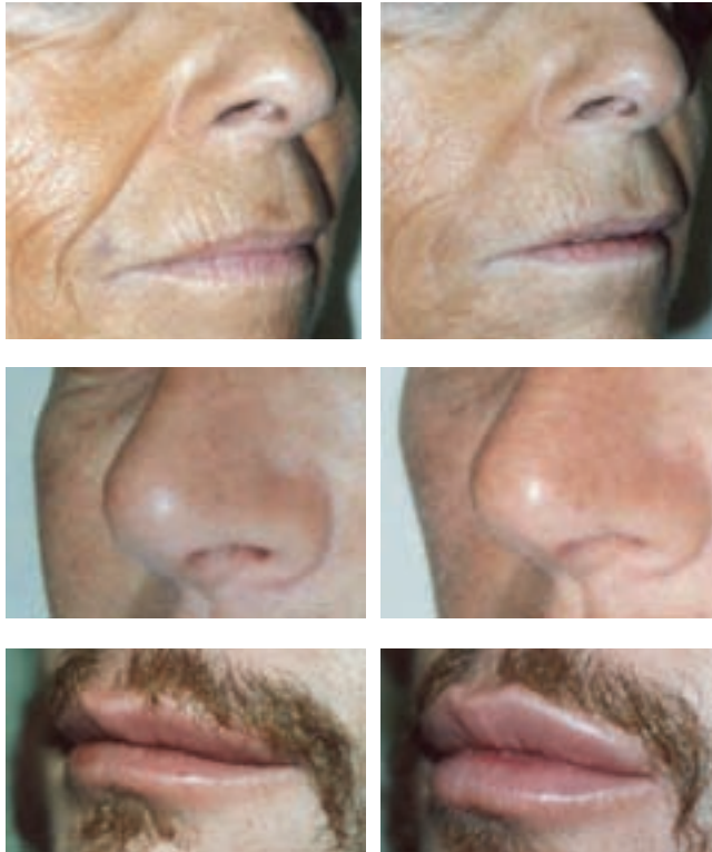
Figure 3: Results