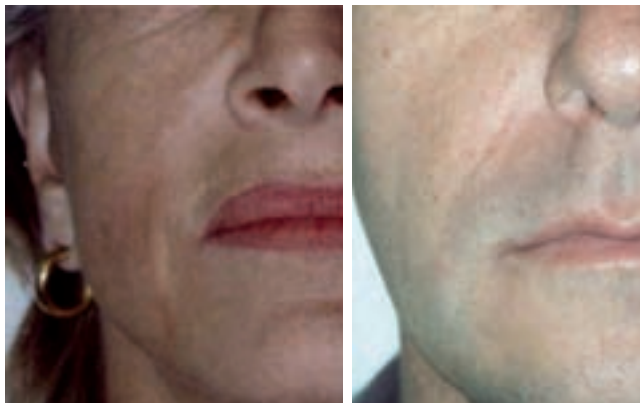
Figure 4: Side effects