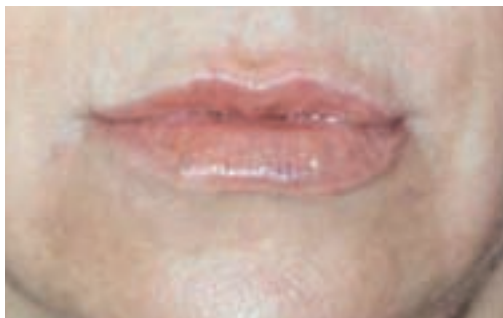
Figure 6: Side effects