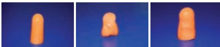
Figure 1: Elasticity-plasticity of ear protection Ohropax®

A distinct improvement of the various zones treated persisted for most of the subjects followed. (Figure 3)